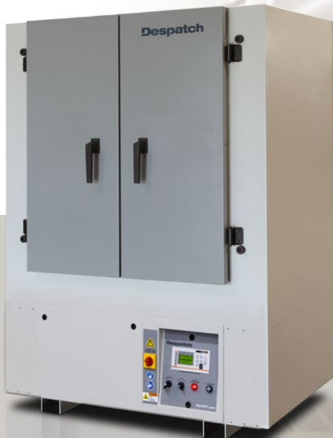
New smaller footprint on RAD2-19 model

This oven is equipped with the Protocol 3™ microprocessor-based temperature and hi-limit controller with large LCD display and real time clock for auto start capability. The LCD display shows temperature readings along with clear, detailed information on oven status. The data-logging functionality enables reporting and analyzing and data files can be exported via the controller's USB port. Modbus RS485 communications are included for easy data access.